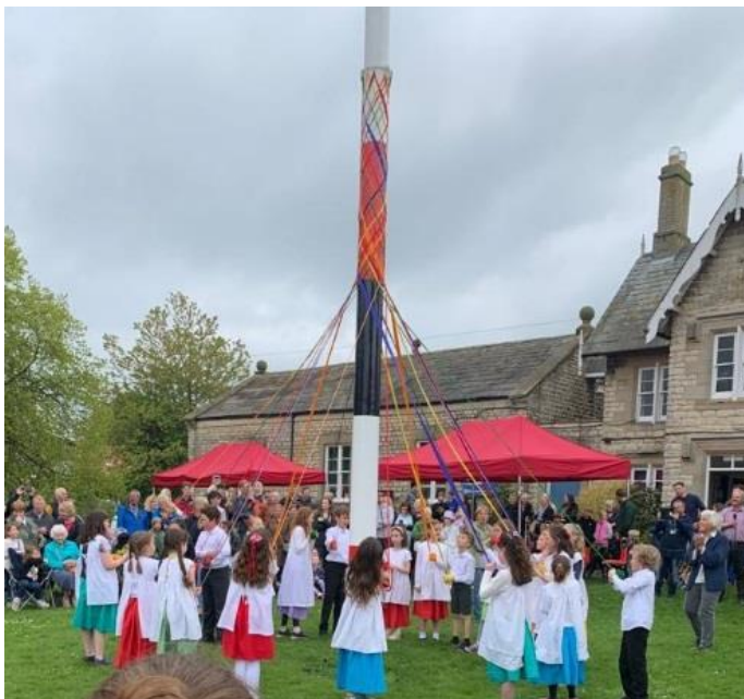
Maypole dancing Slingsby 2022

One of the most popular parts of the day is the Maypole dancing, which will involve the children from Slingsby Community Primary School, accompanied by live music. The children have been busy learning the dances since February in an after-school club and are looking forward to performing on the day. There will also be an opportunity again this year for you to have a go after the children have shown you how to do it so why not get on your dancing shoes and join in?