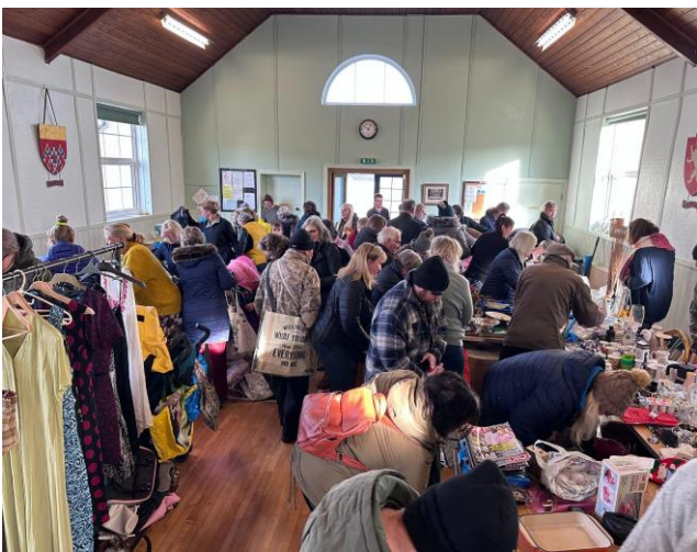
The Give and Take Event in Action

The event was a great success with almost all the gifted items finding a new home and lots of bacon butties sold. Thank you to everyone who donated items, anyone who came and took them away and the Village Hall Committee for letting us use the hall at the same time as the Bacon Butties event. Thank you also to all the volunteers. We hope to do another Give and Take Event so if you're planning a clear out watch this space.