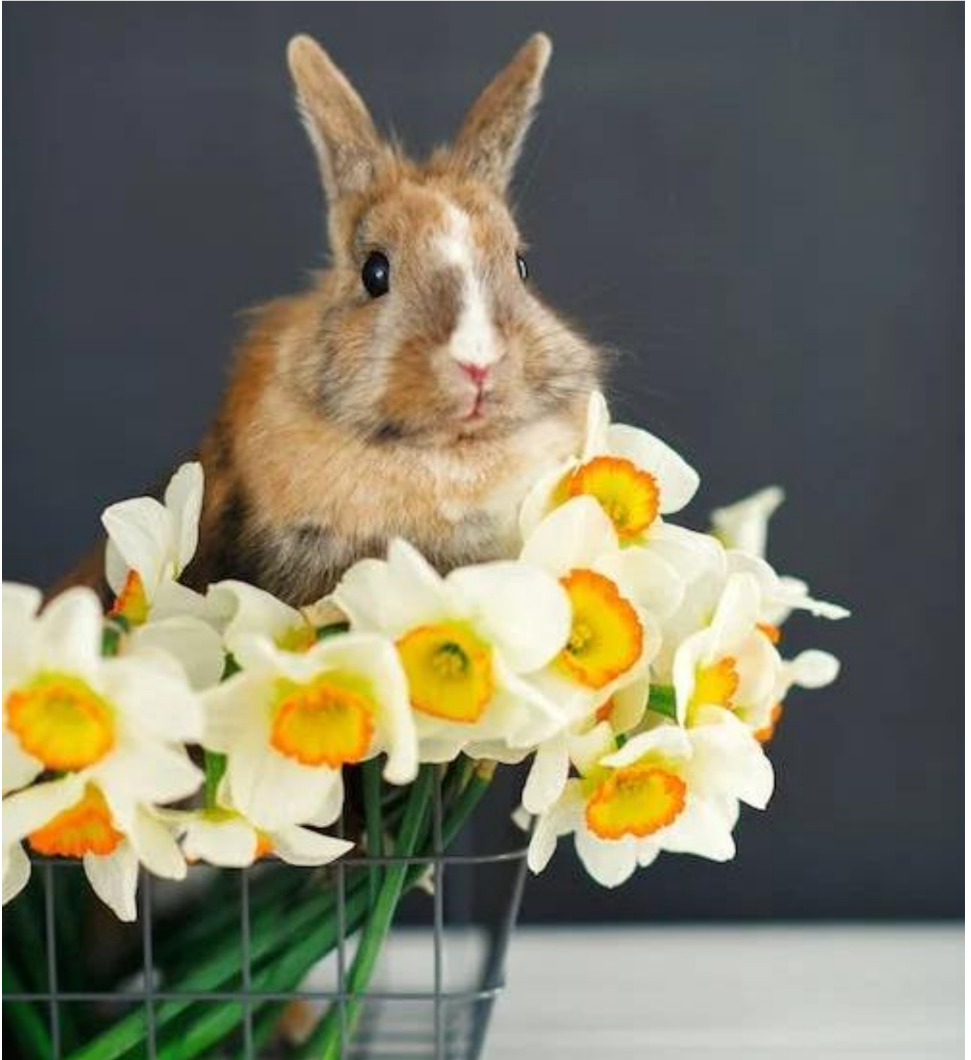
Easter bunny